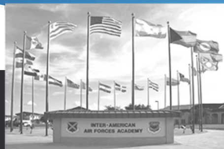
JBSA-Lackland, TX 1993-Present