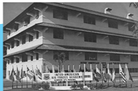
Albrook AS, Panama 1943-1989