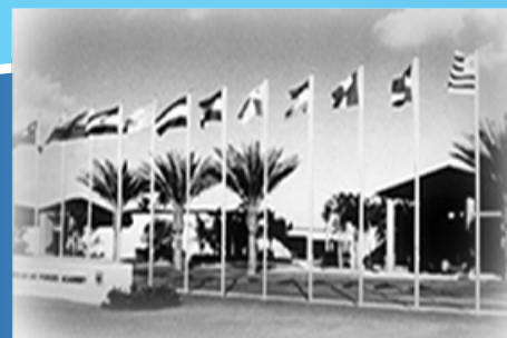
Homestead AFB, FL 1990-1992